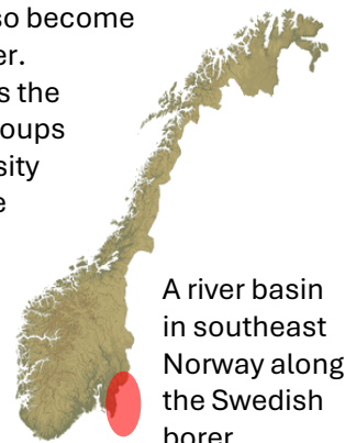
A river basin in southeast Norway along the Swedish border

All these groups of interests are already involved and can be of value to projects through e.g. workshops or interview.